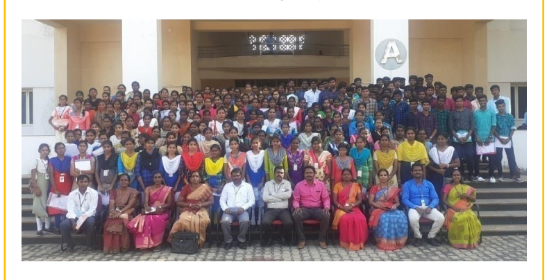
Participants belonging to various arts and science colleges who attended the workshop