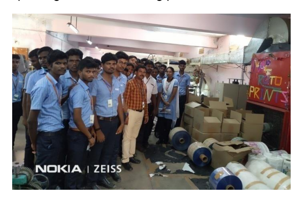
II year Mechanical Engineering students during industrial visit to MAP ROTO Prints, Paramathi Velur

50 students from II year Mechanical Engineering were taken for an industrial visit to MAP ROTO Prints, Paramathi Velur. The students visited the industry on 13<sup>th</sup> December, 2019 and received exposure on various kinds of machineries which are used in printing and their working processes.