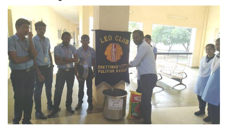
Staff and students contributing for Cup of Rice Scheme

The Leo Club of ChettinadTech sponsored 150 kilograms of rice to three NGOs namely, Sakthi home for Special Children, Sanapiratti (75 kilograms), Netdhra Trust - Old age Home, Vadakkupalayam (75 kilograms) and Anbalayam, Thanthonrimalai (25 kilograms) under the 'cup of rice scheme'. The contributions were made by the students and staff of the college.