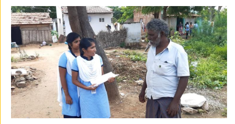
Our students while taking survey about water supply in individual houses