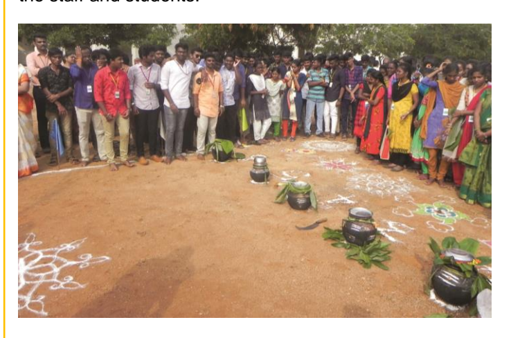
Our students and staff preparing sweet pongal dish

Pongal was celebrated in a traditional manner at ChettinadTech on 14th January, 2020. As part of the celebration, many competitions like preparation of sweet Pongal by each department, Rangoli, Pot Breaking, Tug of War, Jute Bag Race, Potato Gathering, Lemon Spoon Race, Needle & Thread Race and Water Filling Game were organized. Our students and staff actively participated in all the games and the Department of Mechanical Engineering won the prize for the Best Pongal Sweet Dish. The celebrations came to an end with the distribution of pongal to the staff and students.