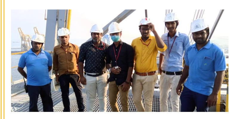
IV Mechanical Engineering students at Chettinad International Coal Terminal, Enoor, Chennai during internship.