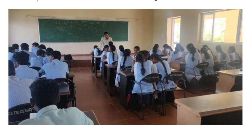
Final year students at aptitude training

The placement and training cell of ChettinadTech organised a 3 - day aptitude training programme for the final students of our college. 3 corporate trainers visited our college and gave training to our students. A total number of 213 final year students from the undergraduate and post graduate departments underwent the training.