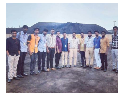
IV Mechanical Engineering students at Chettinad International Coal Terminal, Enoor, Chennai during internship.

During the course of training, the students received technical exposure to vessel unloading, control towers, stacking and reclaiming, loco engine workshop and the shifting of coal to the departure terminal.