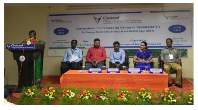
Eminent guests at the valedictory function of ICAN - 2019