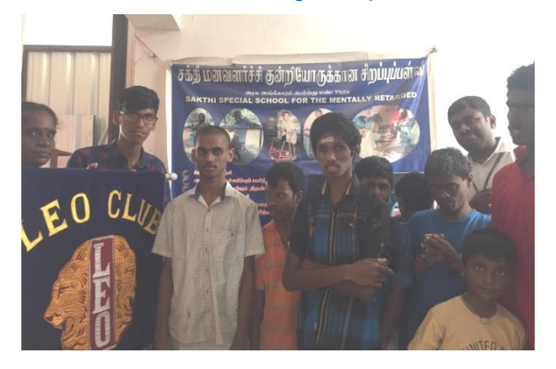
While sponsoring 150 kilograms of rice to three NGOs

"The road to success and the road to failure are almost exactly the same." -Colin R. Davis