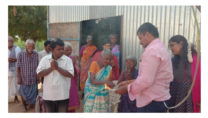
Celebrating Pongal festival with the people in the oldage home