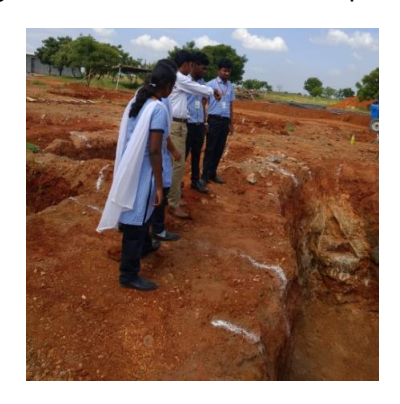
Civil Engineering students exploring on earth excavation techniques during industrial visit

An industrial visit was arranged to Earthwork Excavation of Building, Karur for the Civil Engineering students. 19 students from second year civil engineering attended it and updated their knowledge on earth excavation techniques.