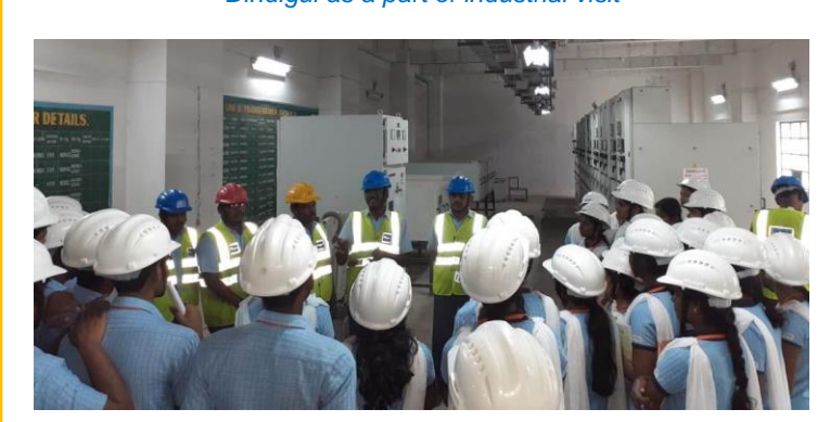
Our students interacting with the personnel of Chettinad Cements Private Ltd., Karikkali, during industrial visit