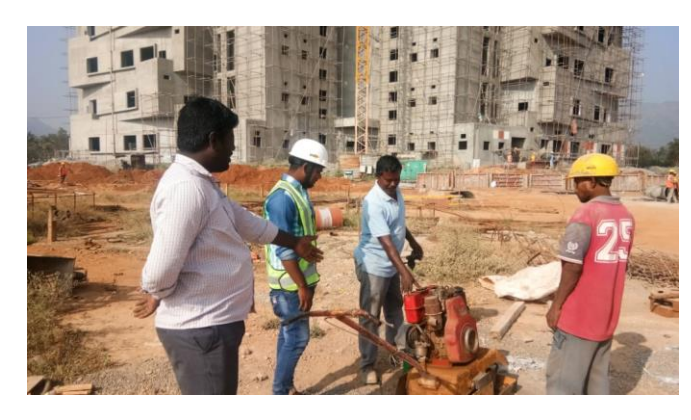
IV Civil Engineering students at KMCH, Coimbatore during internship.

Our IV year Civil Engineering students attended a 9 - day onsite internship training to KMCH, Coimbatore & Ticel Bio Park Coimbatore. 5 students attended the training in the first phase i.e. from 21<sup>st</sup> January, 2020 to 25<sup>th</sup> January, 2020 and 4 students in the second phase i.e. 27<sup>th</sup> January, 2020 to 30<sup>th</sup> January, 2020.