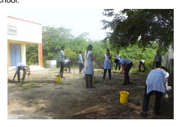
Our NSS volunteers while cleaning the campus of government school, Chinnamanayakkanpatty

During the camp, our students created awareness about keeping the environment clean. Further, they participated in many voluntary activities in the village such as planting saplings, organising medical camp, cleaning the government school campus and renovating the damaged entrance gate of the school.