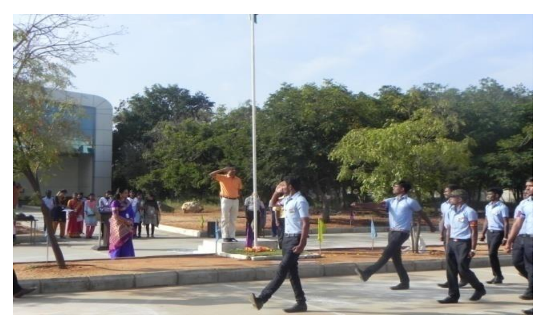
NSS unit of ChettinadTech on March fast