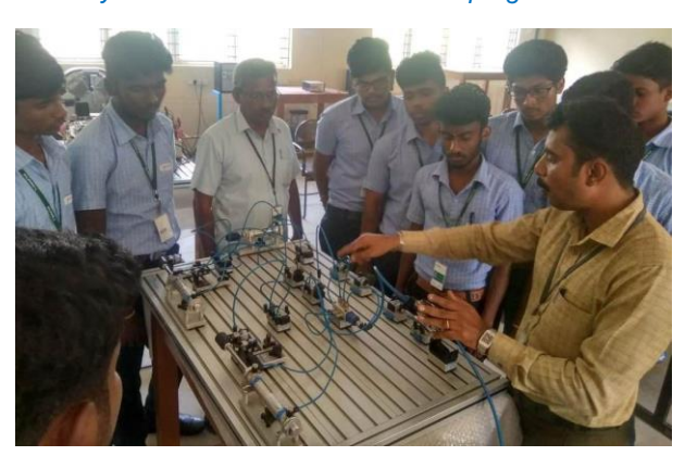
I year UG students at orientation programme