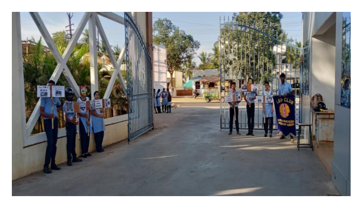
Leo club volunteers creating awareness about traffic rules and safety ride

The Leo Club organized an 8 - day helmet awareness programme from 21<sup>st</sup> January, 2020 to 28<sup>th</sup> January, 2020 in front of the college. During the awareness programme, our volunteers insisted on the importance of wearing Helmet and seat belt among the bike riders and car drivers.