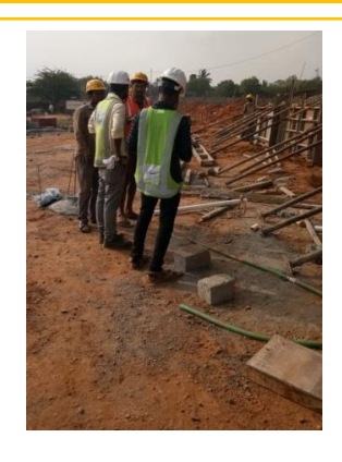
IV Civil Engineering students at Ticel Bio Park Coimbatore.