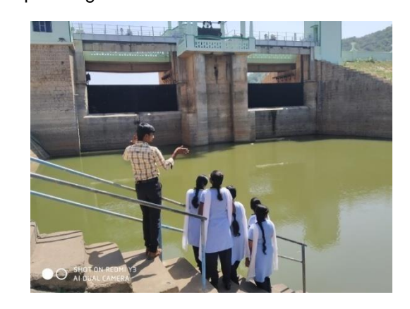
Visit to Ponnaniyaru Dam by the department of civil engineering

The Department of Civil Engineering organized an industrial visit to Ponnaniyaru Dam, Karur on 30<sup>th</sup> January, 2020. III year civil engineering visited the reservoir and updated their knowledge on the construction techniques of a dam and material planning for construction.