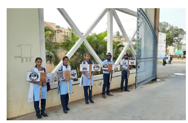
Leo club volunteers creating awareness about traffic rules and safety

"Optimism is the faith that leads to achievement. Nothing can be done without hope and confidence."