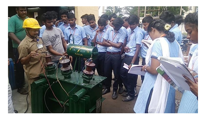
Il year EEE students getting technical exposure on power generation