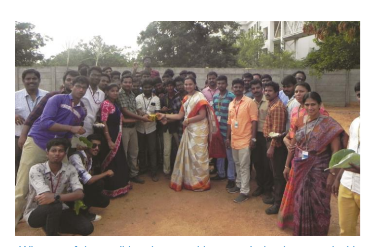
Winners of the traditional competitions are being honoured with prizes

"Whenever you see a successful person you only see the public glories, never the private sacrifices to reach them."